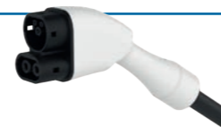
Combo CCS Type 2